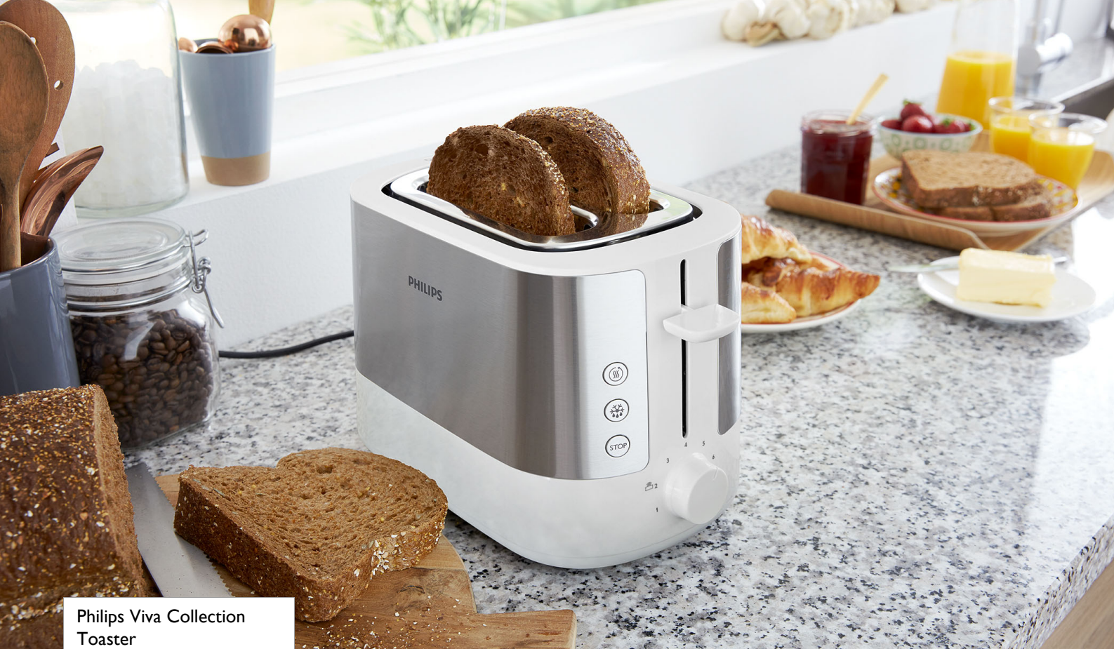
Philips Viva Collection Toaster

Extra wide 2 slots toaster Built in bun warmer White